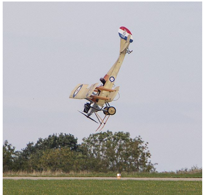
Real photo of the BE2c crash. September 2, 2020. Looks like the Red Baron won that one!

Comments to circlemastersflyclub@gmail.com