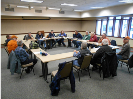
That's a fine looking bunch!