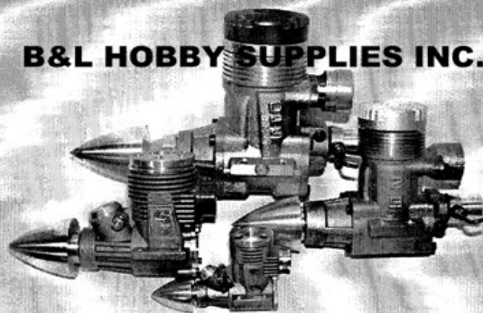
Control Line Speed Engines