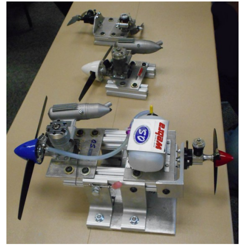
Greg built these test stands and brought them for us to see.