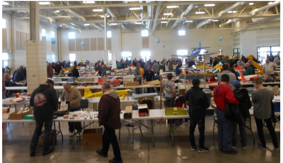
A good overview of the event