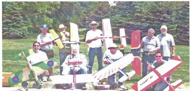
Stunt guys family photo