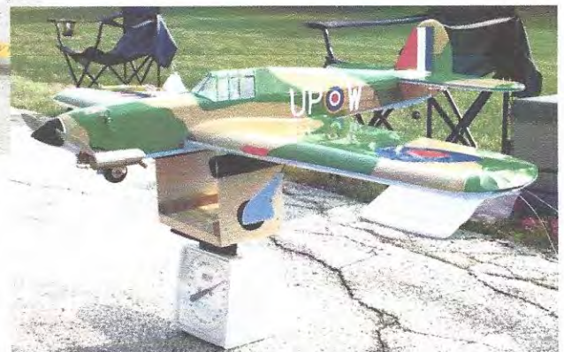
Fine looking semi scale Hurricane stunter