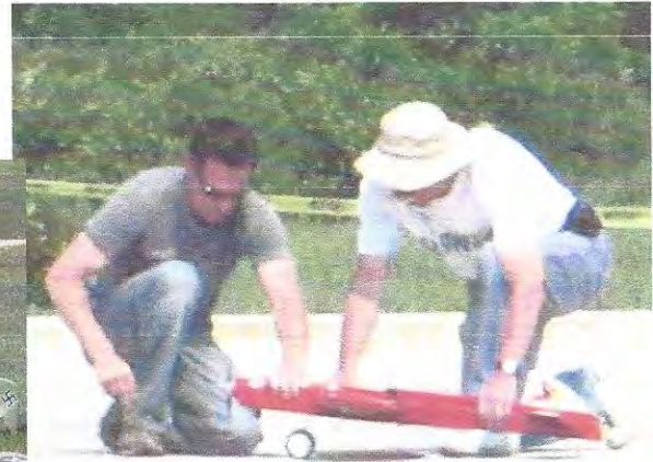
Getting a Cardinal ready to go